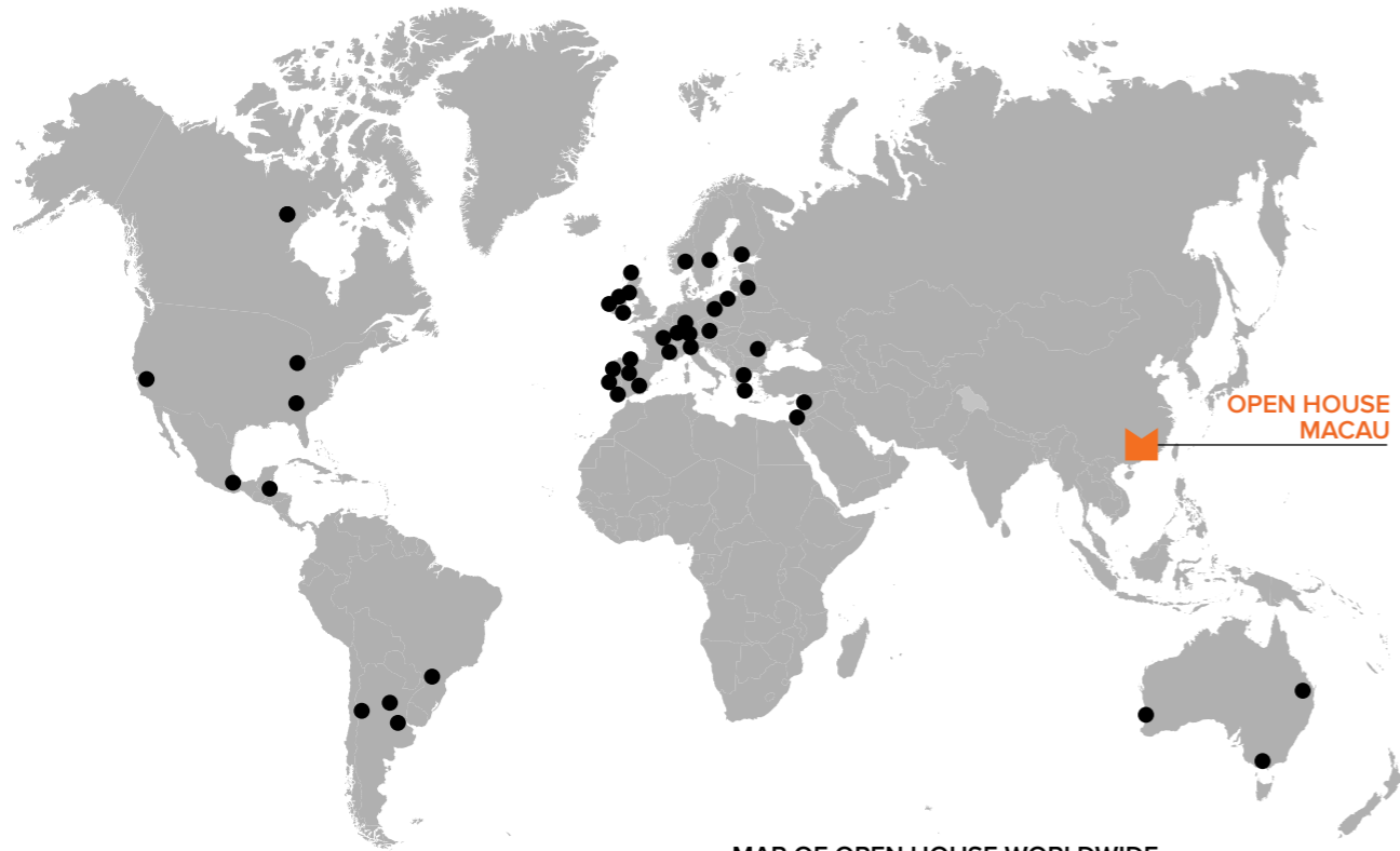
MAP OF OPEN HOUSE WORLDWIDE including 40+ cities in 4 continents, and highlighting OHM pioneer initiative in Asia

Open House is one of the most important global institutions for the promotion of architecture. It conveys a simple but powerful concept: to invite everyone to explore and debate the value of a well-designed built environment, entirely for free.